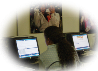
Aki student working on software program.