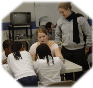
Student's receiving tutoring in the after school program.

The final stop on our grand opening tour was the Hope Central Site—an outreach of Northwest Urban Ministries. This new learning center is an extension and enhancement of a tutoring program which has five elementary school partners, all from the Seattle Public School District: Bailey Gaztert, T.T. Minor, Thurgood Marshall, Leschi, Lowell, and Hawthorne.