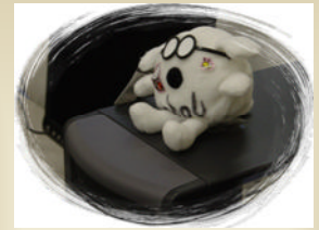
Personalized stuffed Beanies for each student provided by Hope Central.